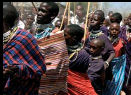
4 Welcome 550 x 750mm Ed Dutton Longido district, Tanzania

While Community Projects Africa volunteers host a primary school football tournament, enthusiastic spectators called 'take my picture', 'take my picture', and asked to see themselves in the camera.