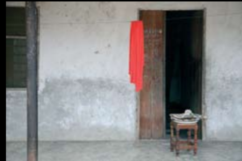
10 A splash of colour

African Sunset. Iconic image of backlit acacia tree captured on safari at Tarangire national park.