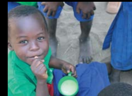
8 A quick snack 550 x 750mm Sarah Bradley Pangani district, Tanzania

Community Projects Africa volunteers join the villagers in Choba for a feast ahead of the Ramadan fast.