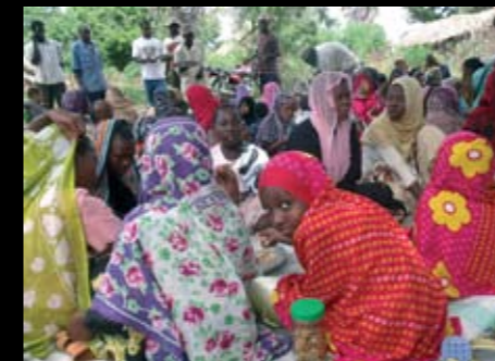
7 Village Feast 750 x 550mm Lucy McCrickard Pangani district, Tanzania

A celebratory tribal dance with Maasai moran from the village of Gelai to show thanks to Community Projects Africa volunteers for assistance in building primary school classrooms.