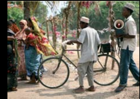
14 Mobile music

A nursery school pupil is summoned to the blackboard to share the right answer in a maths lesson.