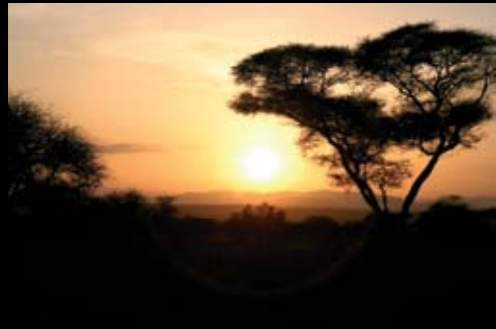
9 Sunset in Tarangire