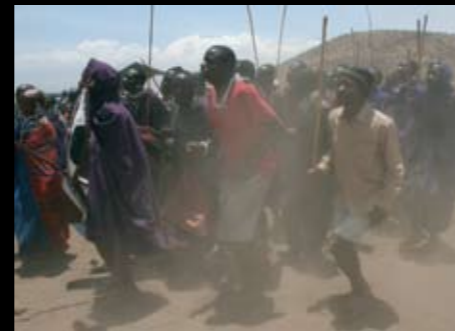
3 Tribal dance 750 x 550mm Claire Pulen Longido district, Tanzania,

The Maasai community are intrigued to see visitors at the furthest edge of the great salt lake.