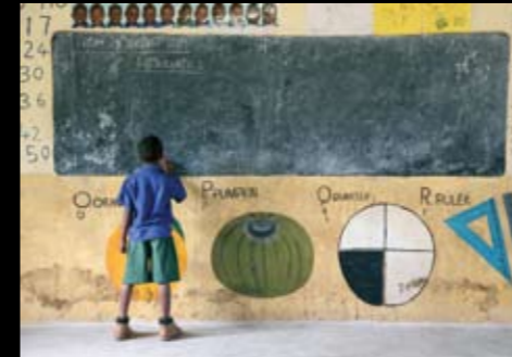
13 The right answer

A splash of colour as a red scarf brightens the doorway of a villager's home.