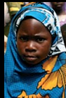
6 The brightest scarf 550 x 750mm Lis Parsons Pangani district, Tanzania

Muslim children of Choba attending the village feast.