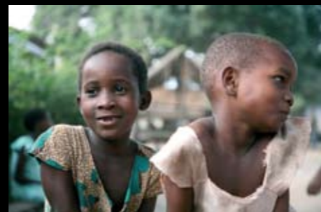
12 Two friends

A jubilant young girl skips on her way to the pre-Ramadan feast.