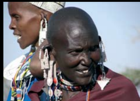
1 Market Day 750 x 550mm Charity Challenge Great Rift Valley, Tanzania

Maasai women on their way to sell beads and crafts at the local market. CPA supports and values economic activities to improve their lives and those of their children.